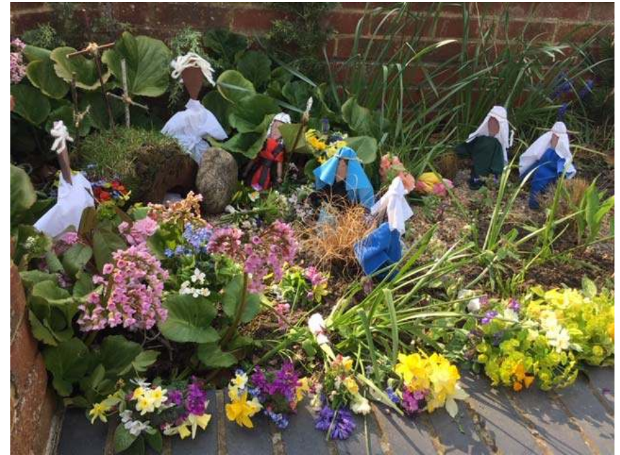
An Easter Garden scheme created by the Flower Guild outside the Cornerstone....

Our membership remains constant, although we would always welcome new arrangers to the Guild.