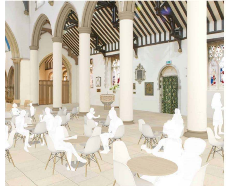
An artist impression of the Church acting as a hub for the local community

We were granted a faculty in December and recruited a fund-raising consultant to help us realise the much cut down Phase 1 of our building plans.